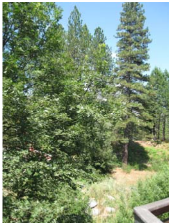
View from back deck

Price: $419,000 or best offer. Contact: Catherine Fish 530-478-1852 E-mail: sunshine.works@gmail.com